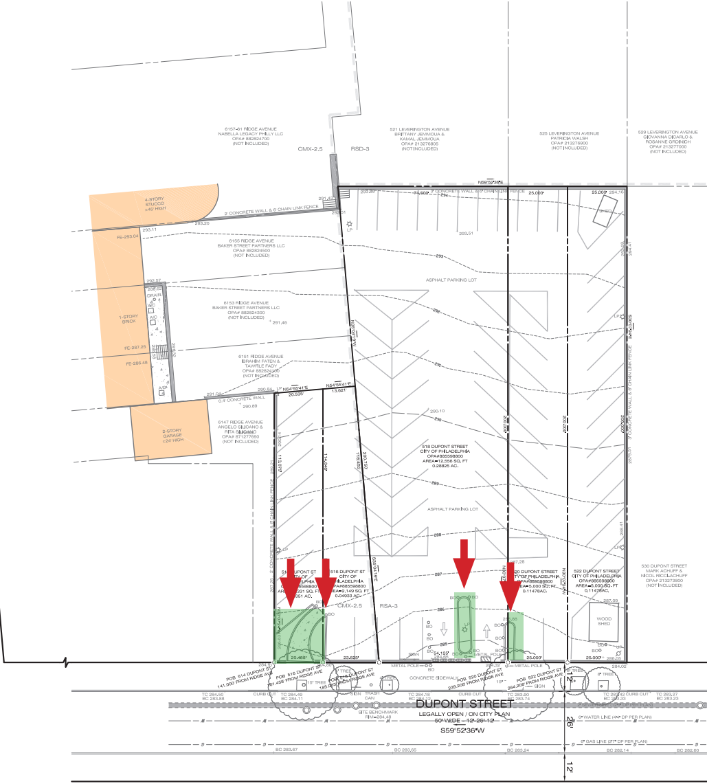
Dupont Street Parking Lot | 514 Dupont Street Maintenance Scope

RIDGE AVENUE LEGALLY OPEN / ON CITY PLAN 60' WIDE - 12'-00" W NS59'0419'W